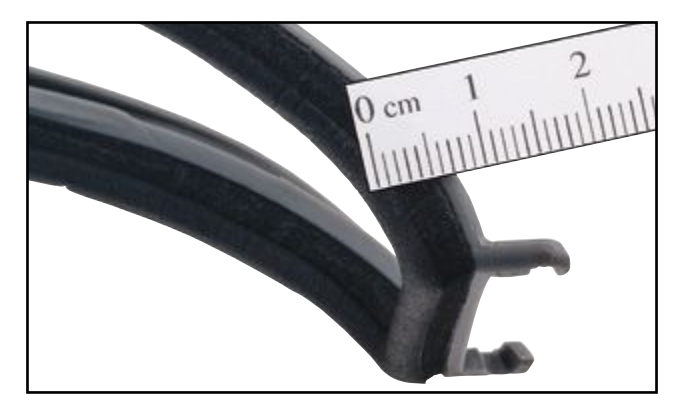
5mm of fire-resistant PEVA foam insulation