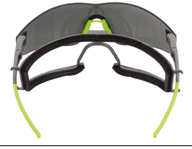
Removable foam gasket