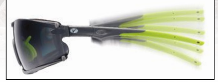
Ratcheting temple arms